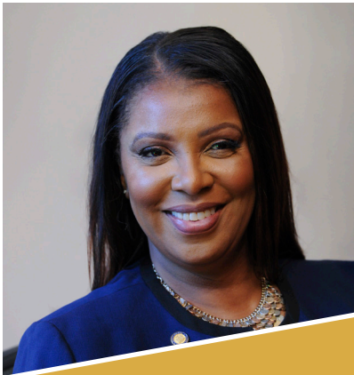
Attorney General of New York Letitia James