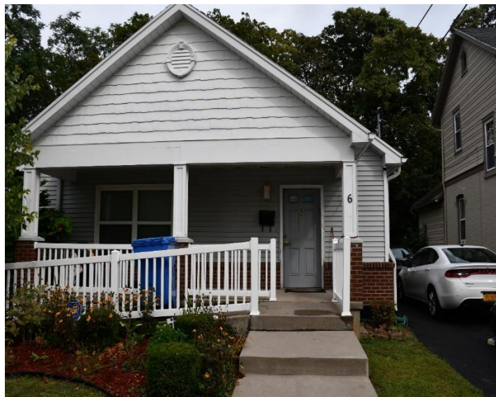
6 Vinewood Place on September 15, 2021. Dedrick James's 2013 White Dodge Dart is in the driveway on the right.

Consistent with these protocols, on September 15, 2021, fourteen members of the Task Force arrived at 6 Vinewood Place to arrest Mr. James.